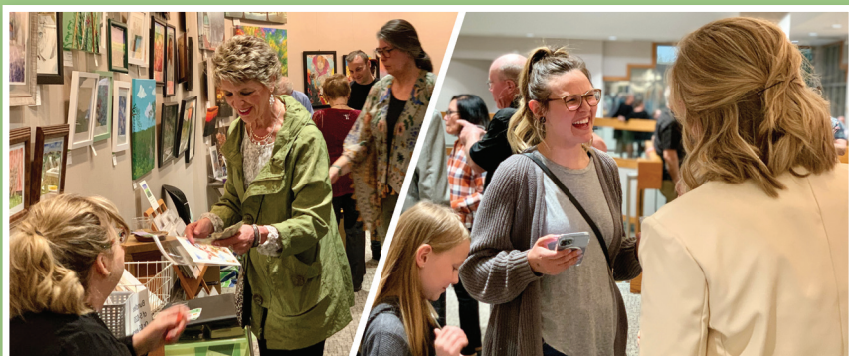
THE ARTS GALA RETURNED!

PGTPL added a total of 11,063 NEW ITEMS to our collection, but that's not all!