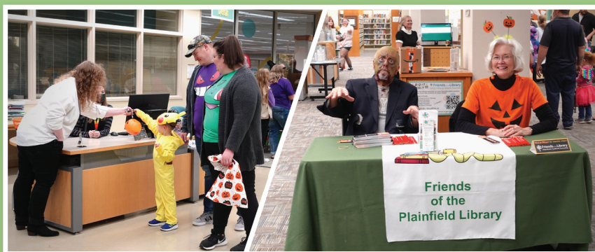
TRICK-OR-TREAT ON MAIN STREET RETURNED!